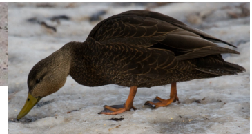
American Black Duck